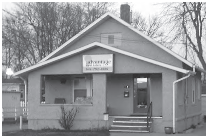
Advantage Real Estate